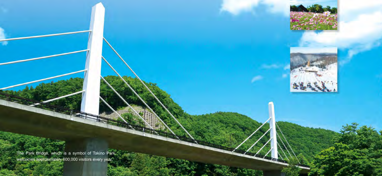
The Park Bridge, which is a symbol of Takino Park, welcomes approximately 600,000 visitors every year.

* For details, see Guide to Takino Snow World.